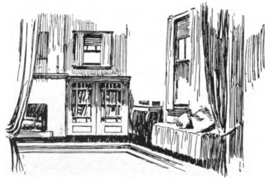
Another treatment of a corner of the living room, as seen from the vestibule. The little windows beside the fireplace afford excellent nooks below for books or fireside seats.